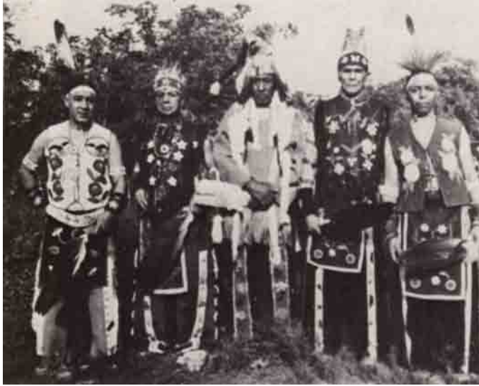
Tribal council of the Lenape Sand Hill band 1920s

This discovery, while answering one of our questions, makes the choice of a Cherokee phrase all the more puzzling. Since Monmouth Council is in the midst of what had once been Lenape tribal lands, why would our lodge founders use a Cherokee phrase? As it turns out, the only organized Native American group in Monmouth County in the mid-twentieth century was a small, but significant group named the Sand Hill band. This group included descendents of both the Delaware and Cherokee peoples. We can imagine that our lodge founders asked a member of the Sand Hill band to translate in the pines , and that the answer was given in Cherokee.