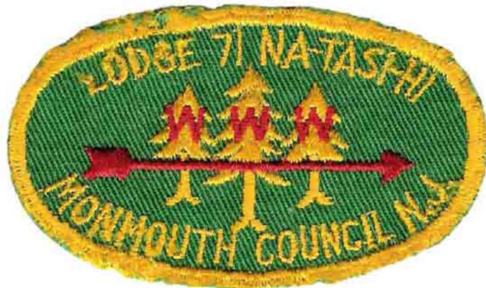
First lodge insignia which pre-dates the common use of pocket flaps

We turned to Raymond Whritenour, another Delaware language expert, to obtain a Lenape translation for in the pines . His answer was: In Lenape, in the pines would be "kuwewunk"-pronounced 'coo-way-wung' with stress on the second syllable.